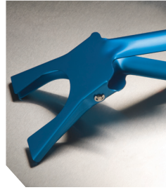
90mm Aluminum Clamp