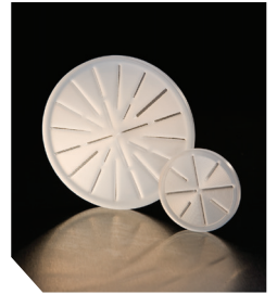
47mm/90mm KEL-F Screen