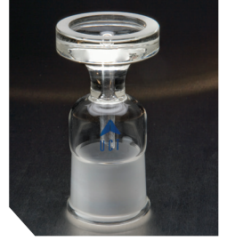
47mm Support Base