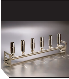
6 Station Manifold