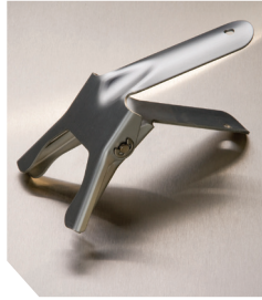
47mm Aluminum Clamp