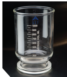
90mm 1000ml Funnel