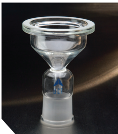
90mm Support Base