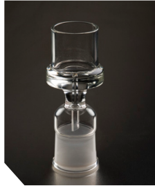
Glass Cartridge Adaptor