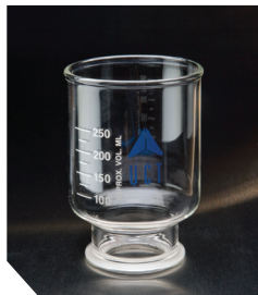
47mm 300ml Funnel