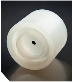
Universal Cartridge Adaptor