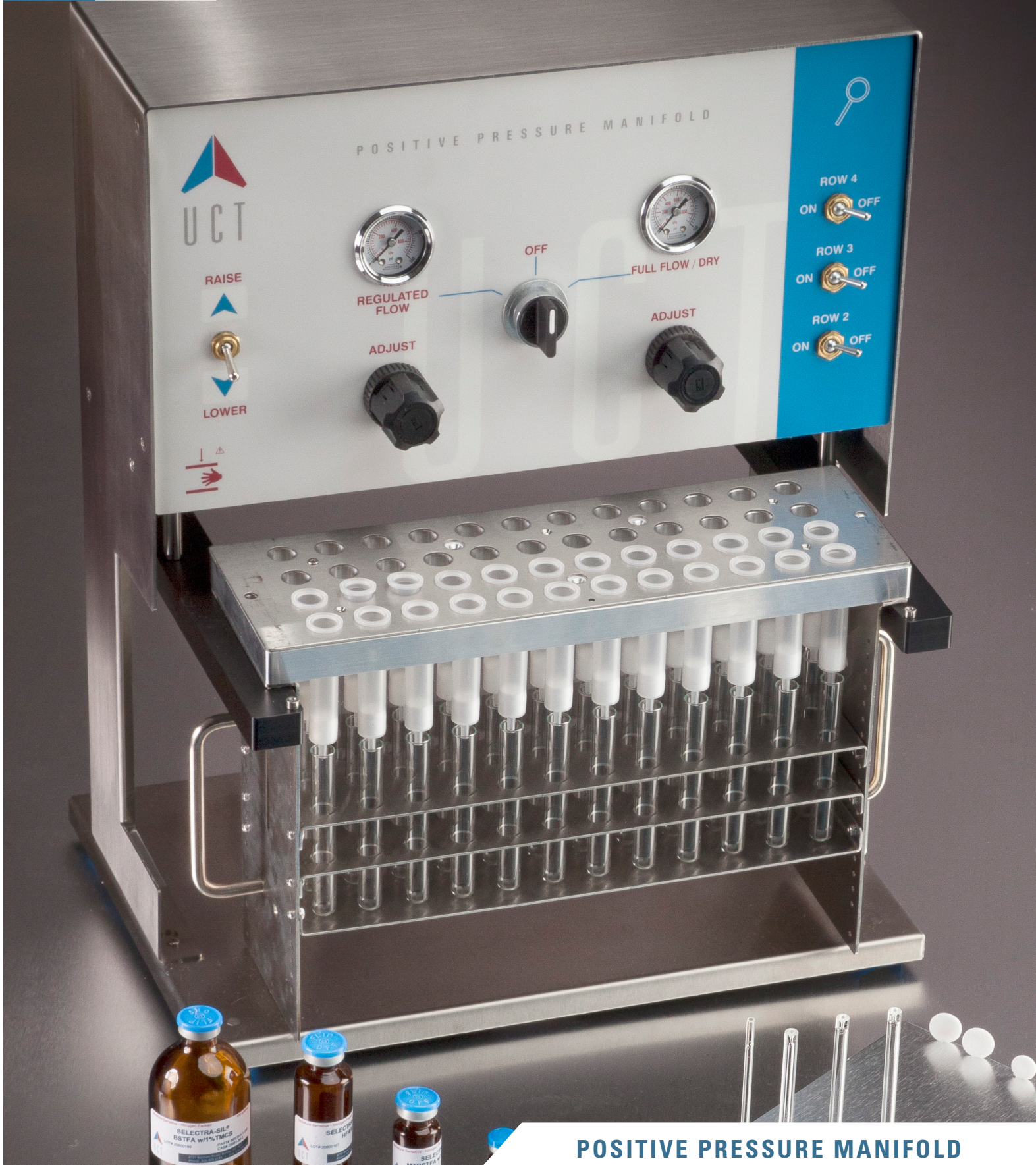
POSITIVE PRESSURE MANIFOLD